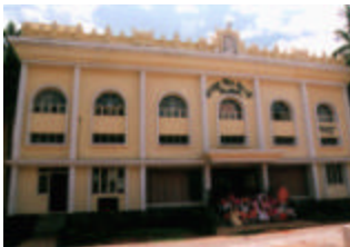
Datta Venkata Temple